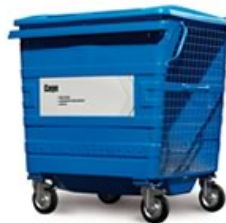
Dimensions in millimetres