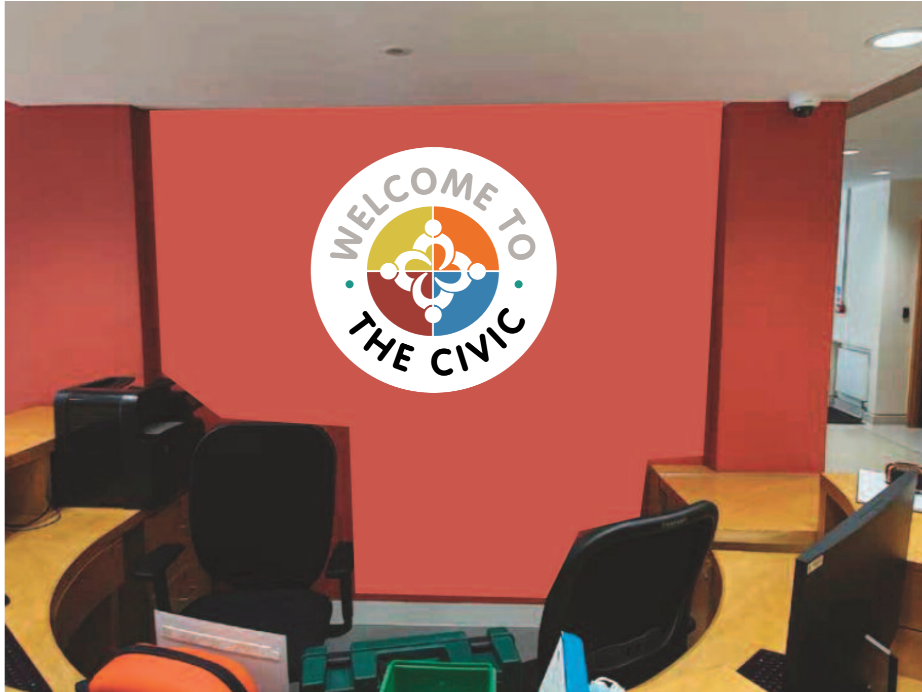
RECEPTION WALL GRAPHIC – AFFIXED TO BACK OF RECEPTION WALL / © martyn royce 2021