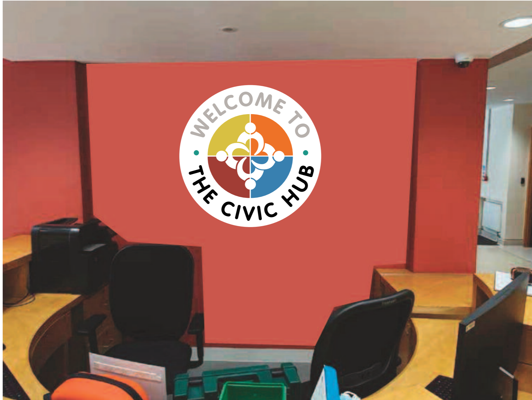
RECEPTION WALL GRAPHIC – AFFIXED TO BACK OF RECEPTION WALL / © martyn royce 2021